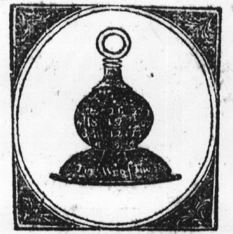
His new improv'd PERPETUAL CALENDAR SEALS.

Small working Gold/mith, Jeweller, E3c. No. 29. South Front street, Philadelphia. RESPECTFULLVinforms the public, that he executes every article in the above franches, in the most elegant manner, of the best materials, and on terms so low as to make it the interest of those who wish any article in his line to give him a preference; and on trial it will be found, that for goodness of gold and silver, elegance of workman ship, and moderate prices, he is not to be excell'd by any of his profession on the continent.